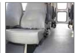
Spray-on Textured Flooring