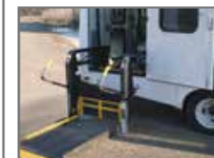
Rear Wheel Chair Lift