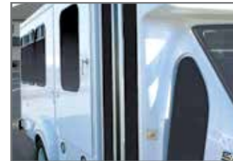
High Gloss Exterior Fiberglass