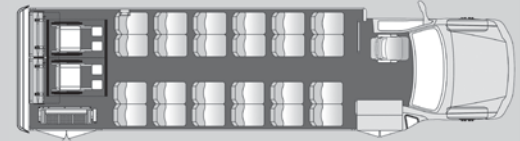
24 Passenger Plus 2 Wheelchair 4 Passenger Flip Seats Plus Driver