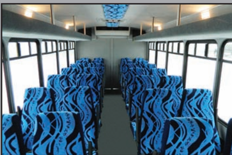
Spacious interior with high-back seats and overhead luggage racks