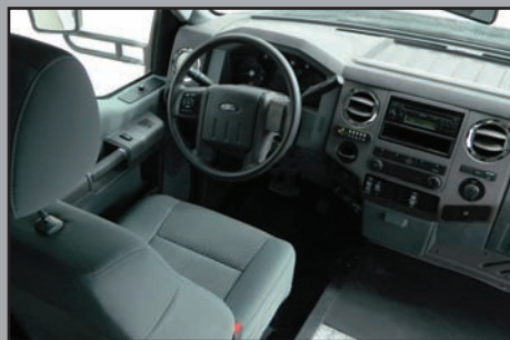
Conveniently located switches and easily-accessible driver's area