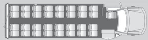
32 Passenger Plus Driver