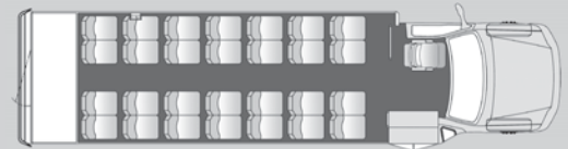
28 Passenger with Rear Luggage Plus Driver