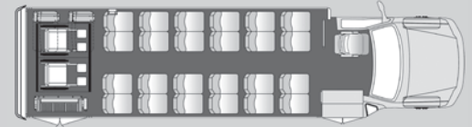
24 Passenger Plus 2 Wheelchair 4 Passenger Foldaway Seats Plus Driver