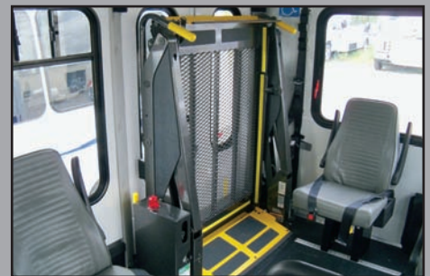
Optional ADA wheelchair lift mounted in the rear of the bus