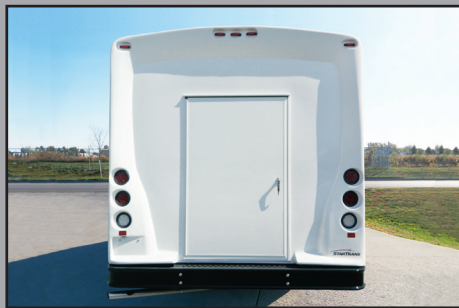
Stylish fiberglass rear cap with rear luggage access door