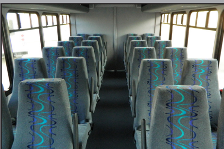
Spacious interior with high-back seats and overhead luggage racks