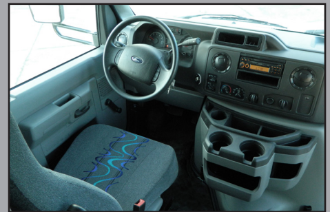
Comfortable and easily-accessible driver's area